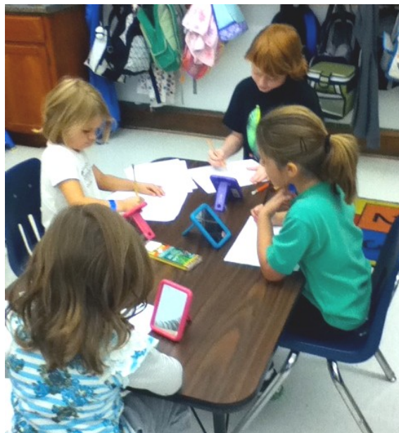
1st and 2nd grade Art Class

Nothing less than the very existence of our School is dependent on your gift.