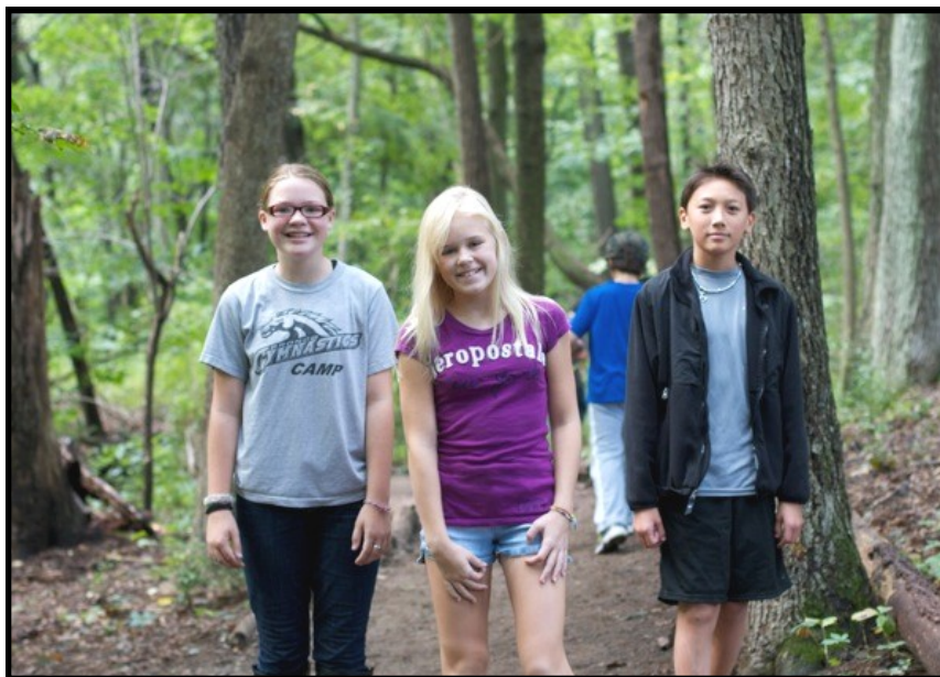
September 10th, 2011 - Kleinstuck Walk